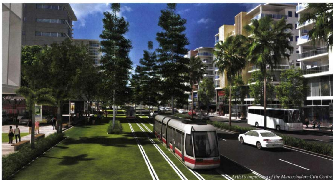
Artist's impression of the Maroochydore City Centre

Education is another priority. The University of the Sunshine Coast (USC) is one of Australia's fastest-growing universities, and is on the brink of achieving a Times Higher Education ranking in the world's top 100 universities aged under 50 years – a remarkable achievement for a university that only celebrated its 20th anniversary this year.